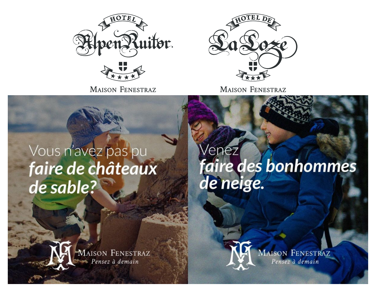
MAISONS ALPINES Courchevel 1850 - Méribel Mottaret - FRANCE